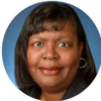
Rita Green Academia